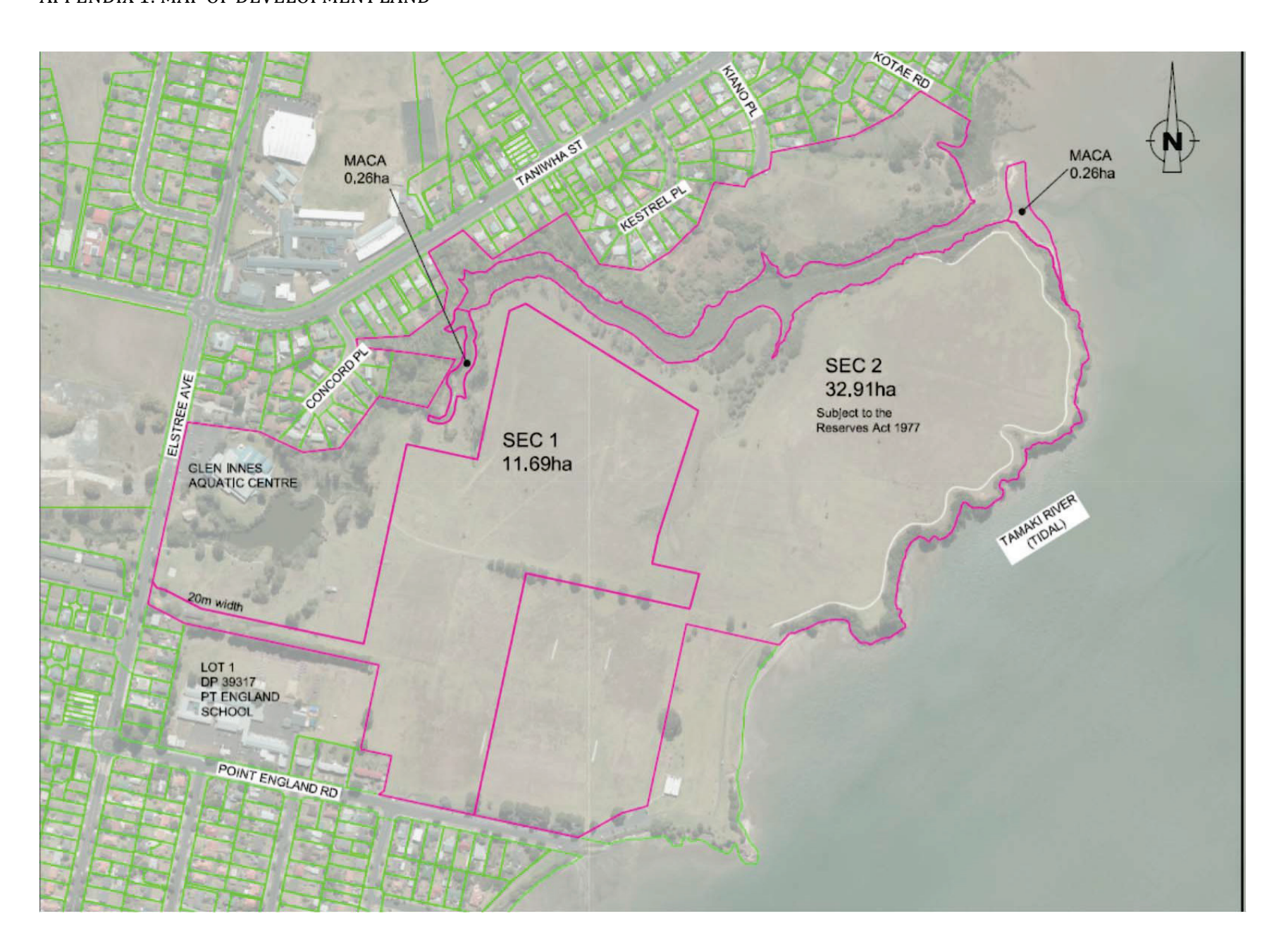
APPENDIX 1: MAP OF DEVELOPMENT LAND