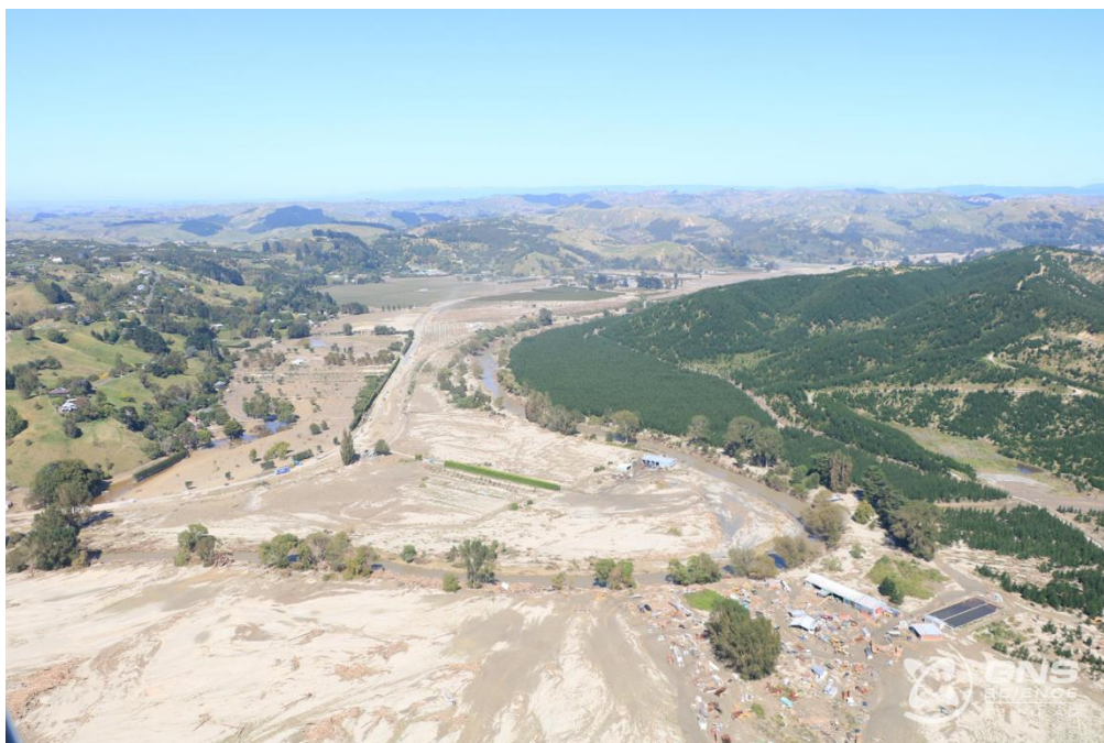
Figure 1: Aerial image of the Esk Valley after NIWE.

identified culvert replacements and bridge repairs as a priority, and they anticipate the sector will also need to carry out earthworks, rebuild roads and replace existing structures damaged by the NIWE.